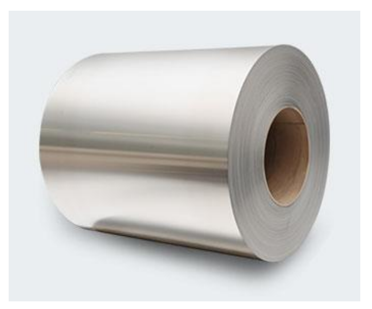
Figure 1. A typical coil delivered from Gränges Americas to customers.

The plant is not connected to a primary smelter. In its casting operation, it melts sourced primary material and sourced internally recycled raw materials to make continuous cast coils. In its cold-rolling operations, it uses own produced cast coils or sourced coils (re-roll coils). Thus, a mix of primary and secondary aluminium is used. The sold product consists of one single aluminium alloy in a certain dimension and with properties specified by the customer (such as strength, formability, corrosion resistance etc.). The product is generally delivered as a coil, see Figure 1.